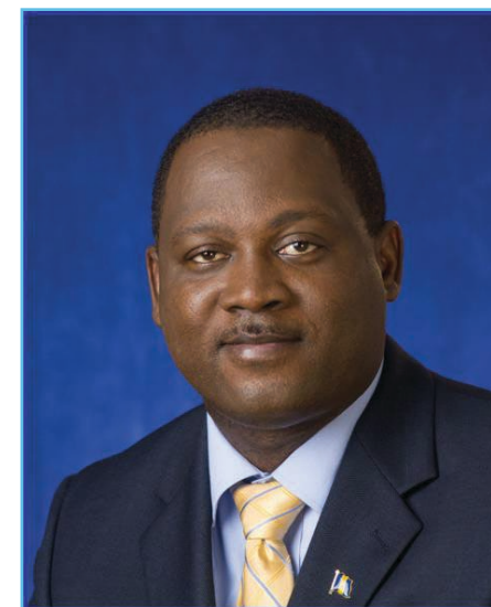
THE HONOURABLE DONVILLE INNISS